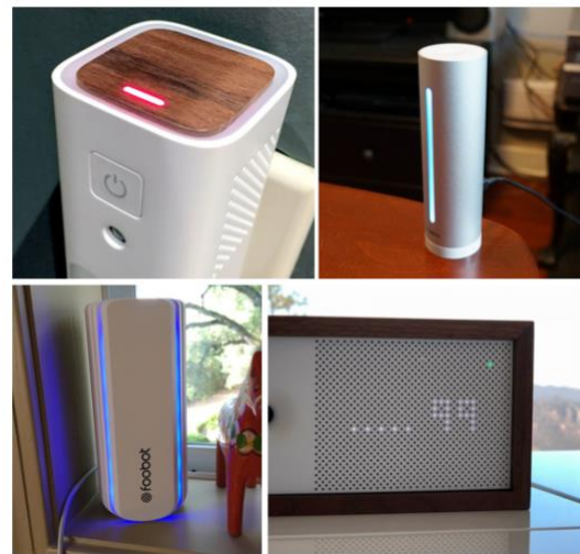
Figure 3. IAQ monitors with various forms of color-coded ambient lights for peripheral awareness

I love the option to turn off the display automatically when it detects you've shut off the lights. (Review #901)