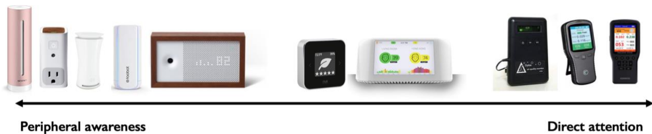
Figure 1. IAQ monitors that require reading the numbers on a screen were placed on the right side of the spectrum, and those with a color panel allowing just a glance to check status were placed on the left side. The names of these devices are: NetAtMo, Awair Glow, uHoo, FooBot, Awair, Eve Room, AirVisual, Dylos, EG Air, and Temton (From left to right).

To determine proper IAQ monitors for review analysis, we first searched IAQ monitors available on Amazon in the US using “indoor air quality monitor” as a search query. Among the list of retrieved products, we chose those that meet the purpose of this study, based on three selection criteria: a device that (1) is stationary with a graphical display to visualize IAQ, (2) monitors at least three different types of air pollutants, and (3) has more than 30 customer reviews. These criteria led us to narrow the list down to 10 IAQ monitors. Next, we conducted a preliminary analysis of these 10 devices, primarily focusing on how these devices display IAQ information. From this analysis, the degree to which user engagement is required when interacting with a device (direct attention vs. peripheral awareness) has emerged as a significant factor to distinguish the type of IAQ visualization (See Figure 1).