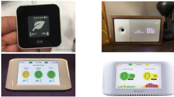
Figure 4. IAQ Visualization screens with various data types (left) and data presentations (right)

presentation of IAQ data, many devices applied icons and color codes to convey contextual information along with the numbers (e.g., A fresh-leaf icon for good IAQ and a yellow frowning-face icon for poor IAQ. See Figure 4 left).